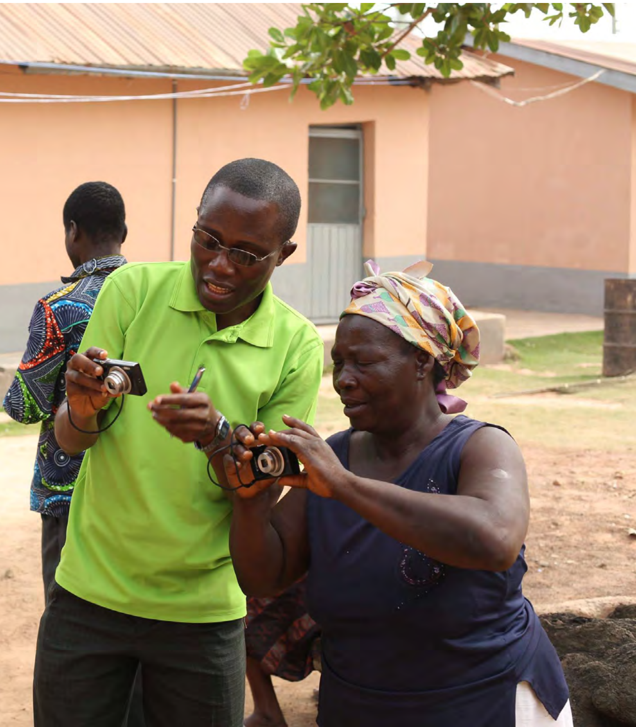
PHOTOVOICE AS AN ADVOCACY TOOL KPANDO, GHANA - 2017